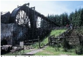
Lianne Jarrett Associates

WEARDALE was historically important for lead mining and the museum incorporates the preserved 19th century Park Level Mine. At Killhope (pronounced "Killup") is a huge working water wheel. This was installed in the 1870s to power the crushing of grit in tanks in an adjacent building, so as to complete the separation of lead ore from worthless stone. The Museum also exhibits a fine collection of local minerals, as well as 'spar boxes' - display cases made by miners to show crystal specimens they had found.